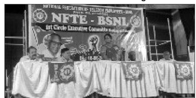
View of dias