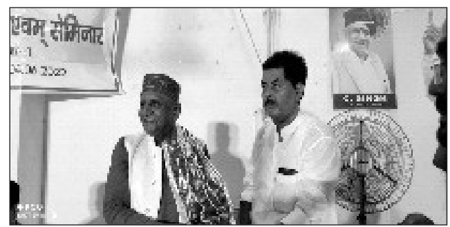
Receiption Commmittee honoured G.S. with garlanded shawl