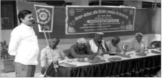
View of dias