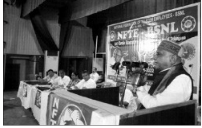
G.S. addressing the NEC