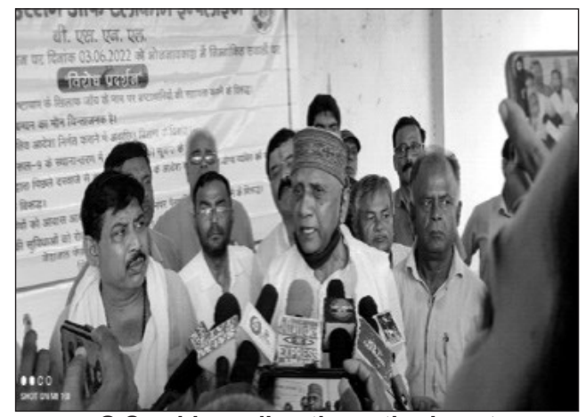
G.S. addressding the gathering at Sanchar Sadan, Patna