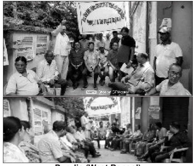
Purulia (West Bengal)