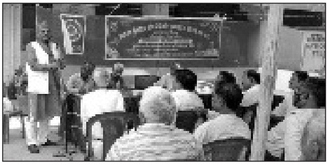
GS addressing the seminar